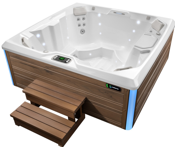
Beam shown with Alpine White shell & Sable cabinet